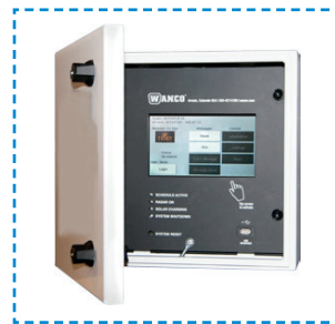
In-Cabinet Controller (location shown)