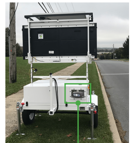
RECESSED CAMERA COMPARTMENT