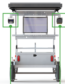
CAMERAS MOUNTED TO CROSSBAR