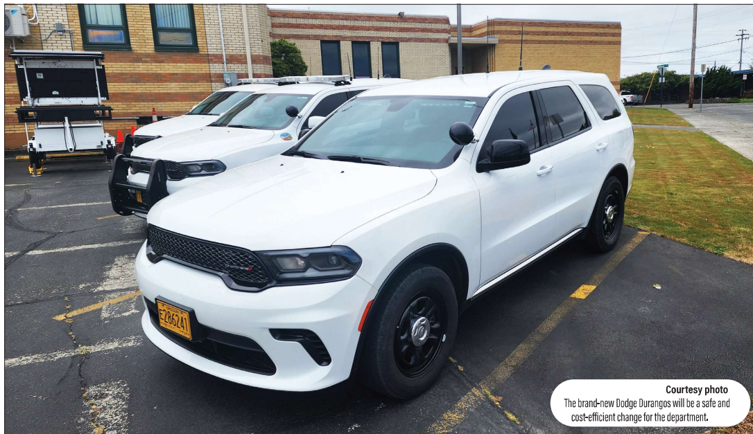
The brand-new Dodge Durangos will be a safe and cost-efficient change for the department.

The vehicles bought by the North Bend Police department through funds from the American Rescue Plan Act (ARPA), are meant to replace the aging older Dodge Chargers, a way to modernize the North Bend fleet of vehicles. The Dodge Durango was chosen because of its list of safety