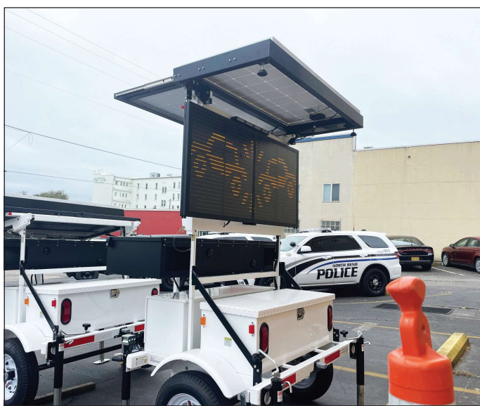
The speed displays can be deployed within minutes and can show a driver's speed or alert drivers to a variety of warnings including accidents.