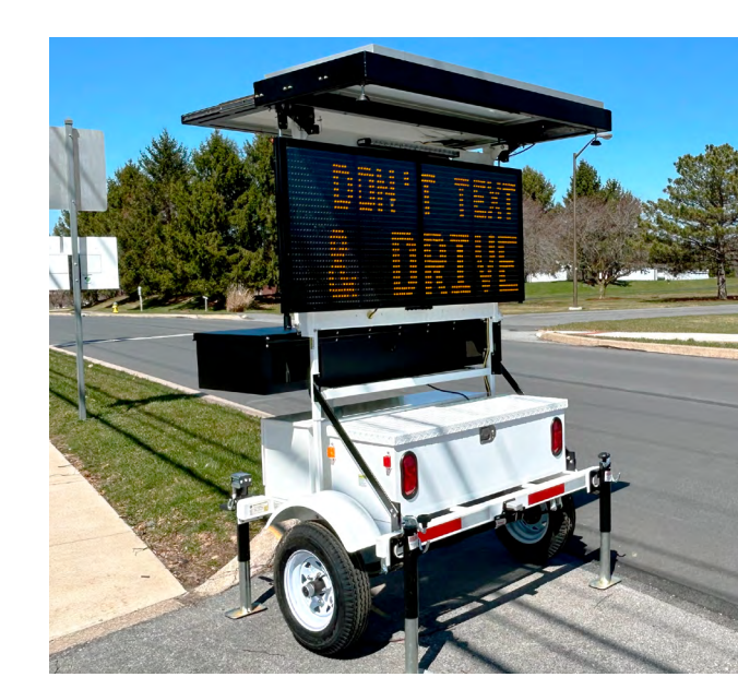
SpeedAlert 24 radar message sign on 380 LPR camera-ready trailer with two-camera enclosure box

Trailers are compatible with our InstAlert variable message signs and SpeedAlert radar message signs so you can share messages, reduce speeding, or collect traffic data while covertly capturing license plates.