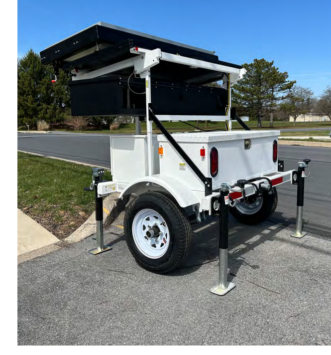
SpeedAlert 24 radar message sign folded down on 380 LPR camera-ready trailer