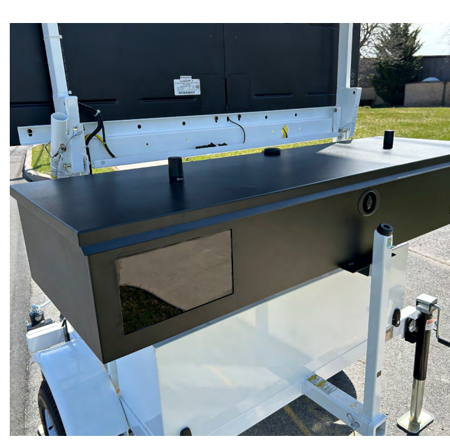
Customizable two-camera enclosure box